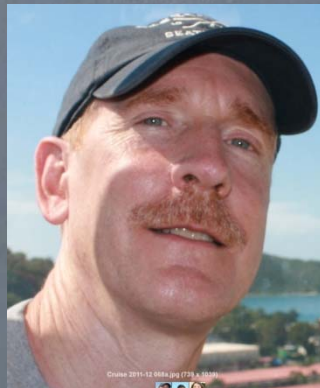
VP Marketing & Membership