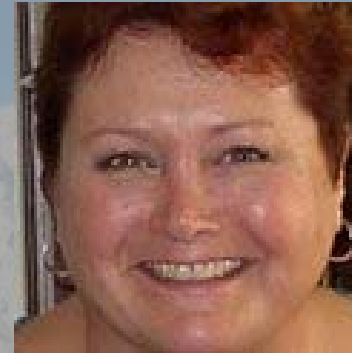
VP Professional Development